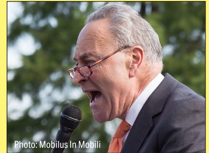
Democrat Senate Leader Chuck Schumer

Biden left $83 Billion of U.S. weaponry in the hands of the Taliban terrorists, along with the Bagram airbase (Over, please)